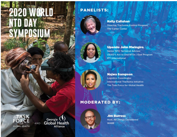
January 30th, 2020 was the Inaugural World NTD Day, celebrated around the world!